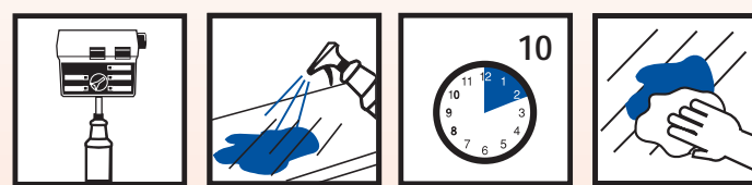
1. DILUTE 2. APPLY 3. WAIT 4. WIPE