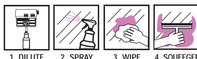
1. DILUTE 2. SPRAY 3. WIPE 4. SQUEEGEE