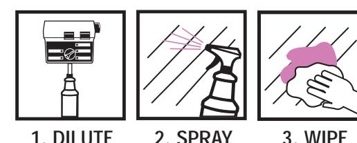
1. DILUTE 2. SPRAY 3. WIPE